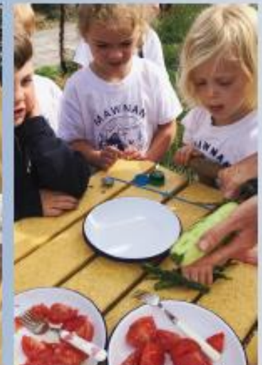
Tasting our produce, Sept 2020

Celebrating the successful close of our Crowdfunder campaign, July 2020