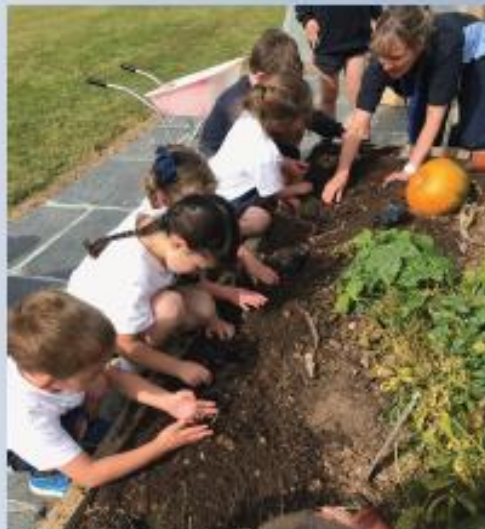
Planting onions, Sept 2020