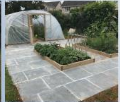
Slate paving completed June 2020