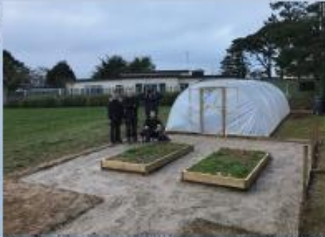
Pendennis volunteers laying aggregate, Feb 2020