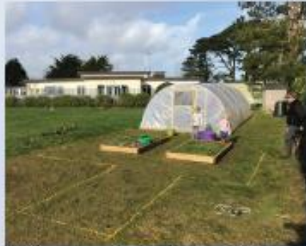
Setting out paved paths, January 2020

A HUGE thank you to all our supporters so far. Since January 2020 we have made enormous progress in building our school garden - all thanks to your generosity. We have raised a whopping £15K of our £21K goal! We hope you enjoy these photos and one day we hope to welcome you into the garden to show you the completed design. The children are already enjoying using the space and are very excited to see further progress!