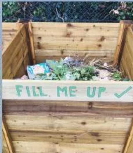
Our new compost bays already in use!