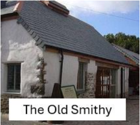
The Old Smithy