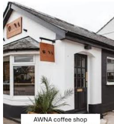
AWNA coffee shop