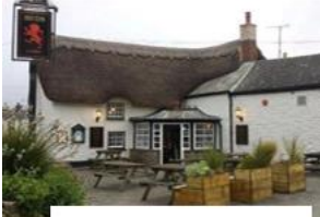
The Red Lion pub