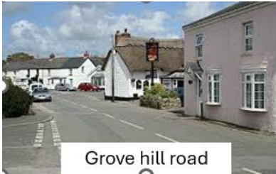
Grove hill road

Vocabulary: Mawnan Smith Cornwall Local Nearby Road Lanes Streets Right Left Behind Route Symbols