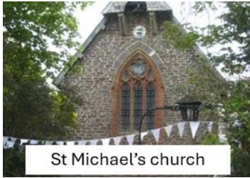
St Michael's church